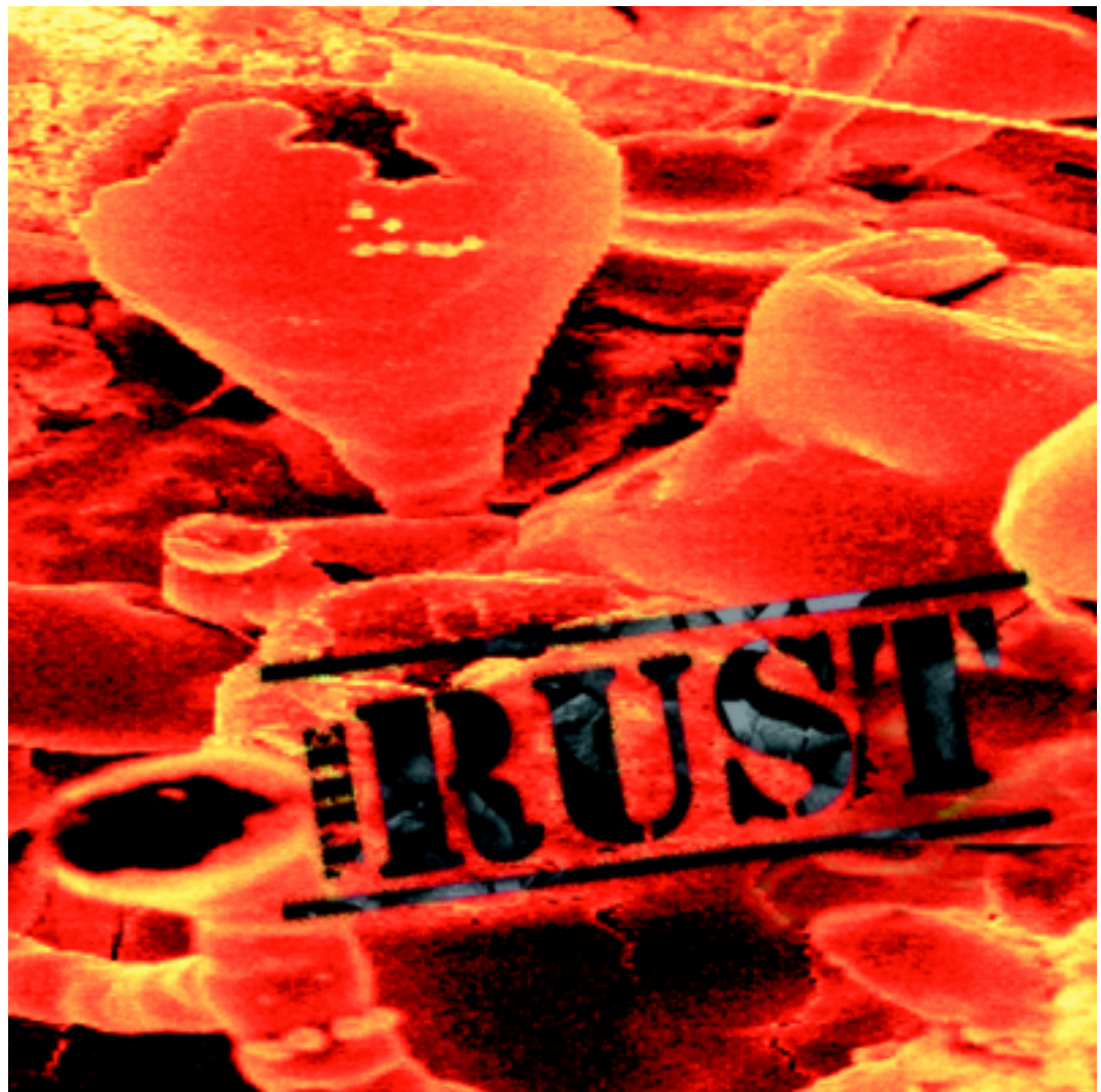
CD "The Rust" available on www.cdbaby.com/cd/rust

THE RUST is a melodic rock band, spanning the range of sounds and emotions from power ballads to heavy guitar rockers. The vocals of Pat Yadon with the band's harmonies accent thought-provoking lyrics and eclectic instrumentation.